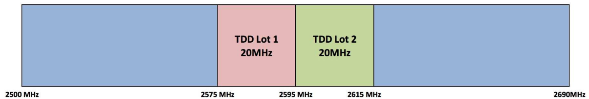
Figure1: 2600MHz Band Frequency Assignment Plan for Public Broadband Data Services

2600MHz Band (2500-2690MHz) – Figure 1 illustrates the available spectrum, lots, minimum spectrum Lot size and the accommodation of TDD duplex mode of operation.